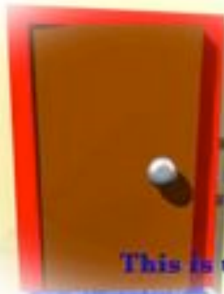
This is the front door.