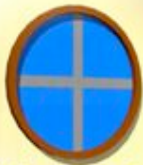
The window is round.