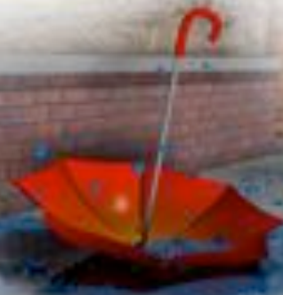
The umbrella is wet.