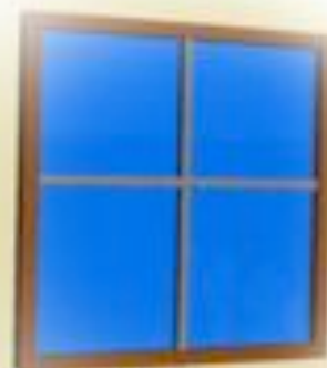
The window is square.