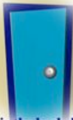
This is the back door.