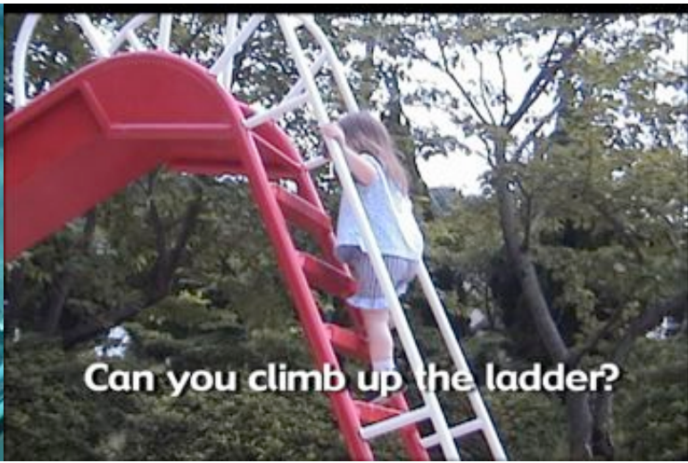
Can you climb up the ladder?