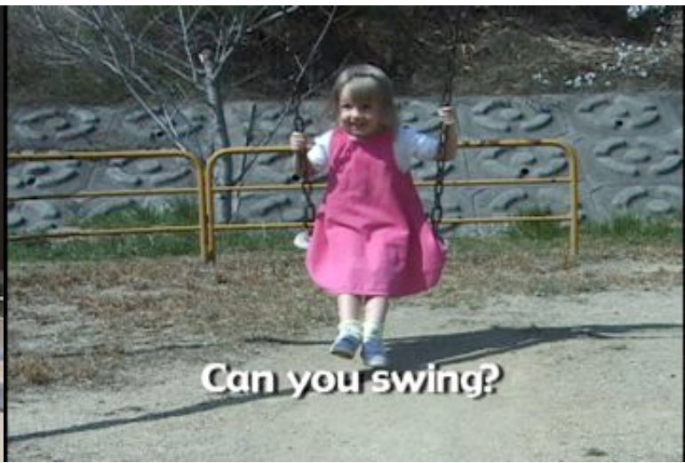
Can you swing?