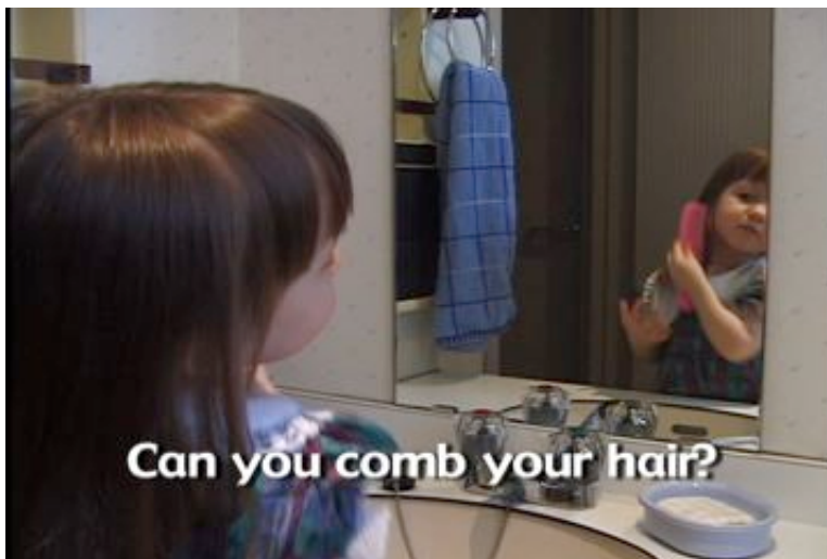
Can you comb your hair?