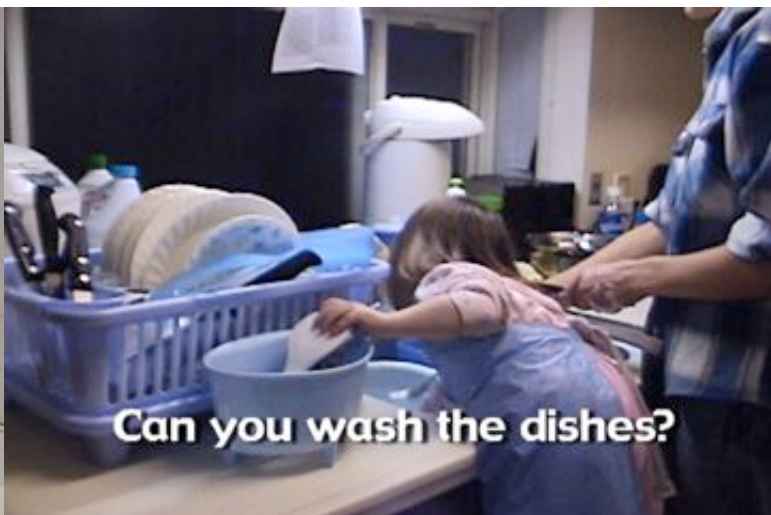
Can you wash the dishes?