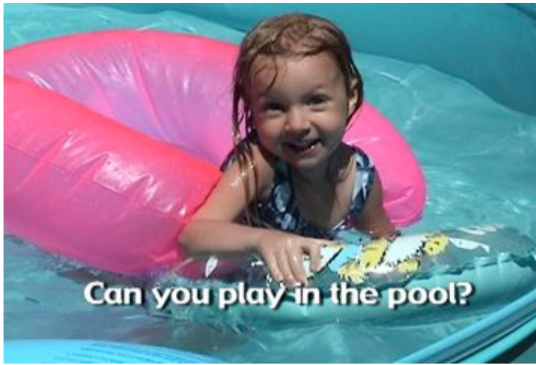
Can you play in the pool?