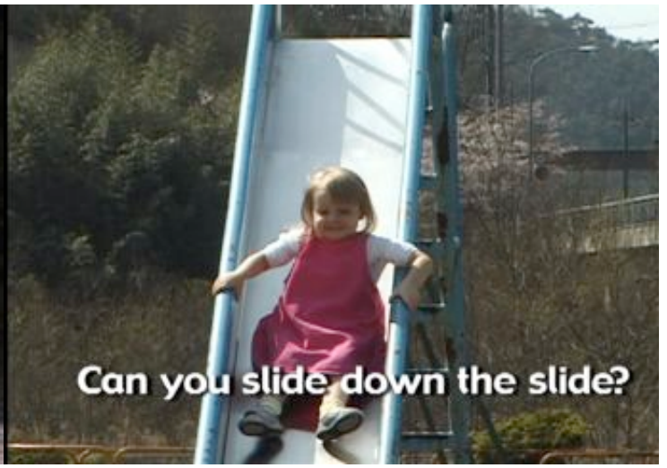
Can you slide down the slide?