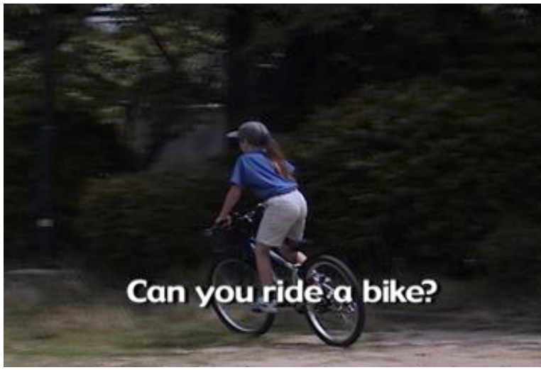
Can you ride a bike?